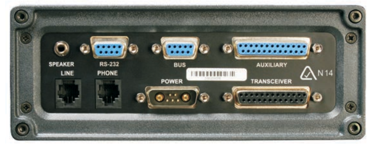
Barrett 2060 HF Telephone interconnect rear panel

Should telephone connection be of such poor quality that the automatic VOX becomes unstable, the telephone caller can switch to manual VOX on their telephone to change the 2060 from transmit to receive.